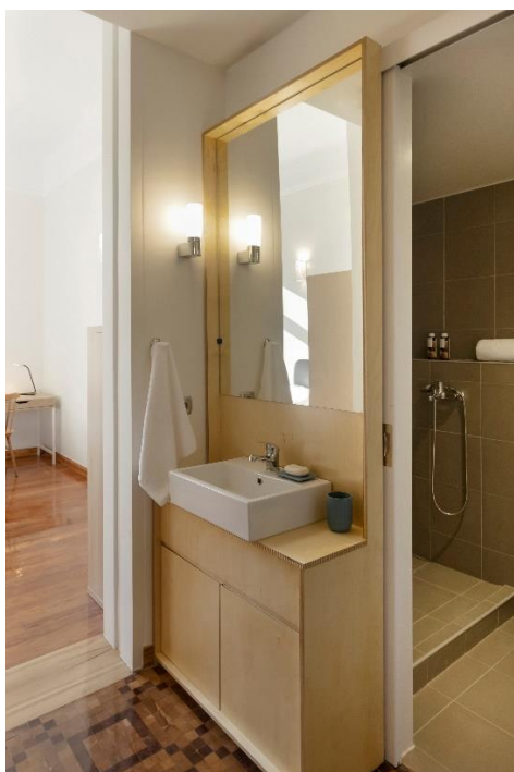
All rooms are ensuite

Each room benefits from its own exclusive use of a fridge in the kitchen area (1 common kitchen per floor), while the kitchen is fully equipped with the availability of a dining table and six chairs.