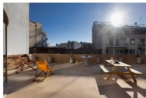
Common Use Roof Terrace