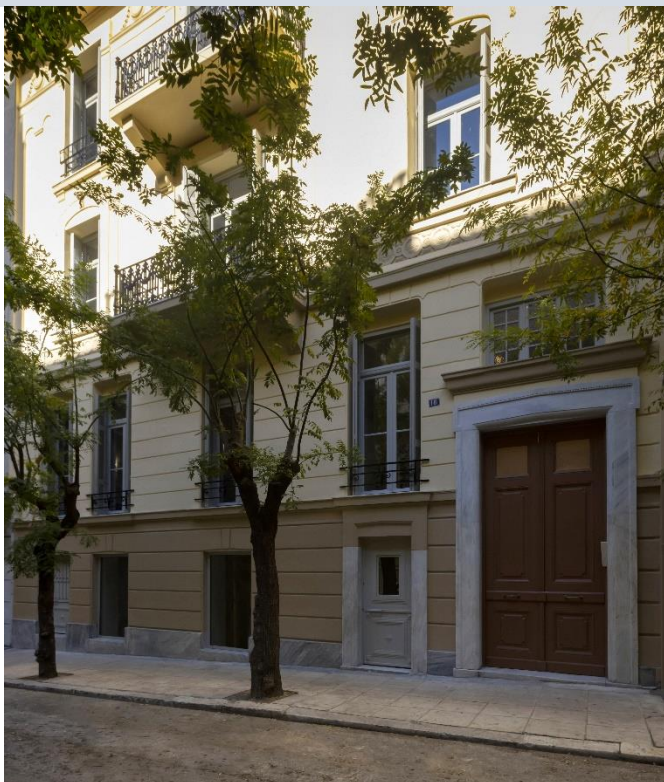
Picture of the building