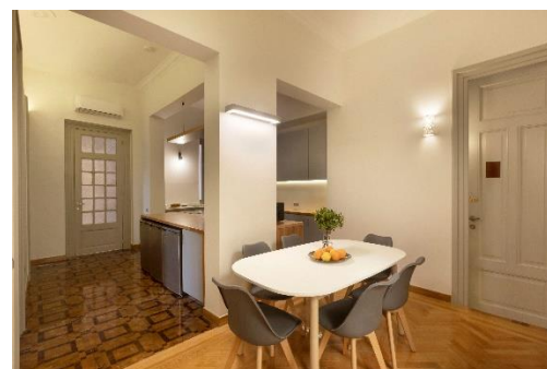
1 common Kitchen Area per floor

Finally, all rooms have access to the Roof Terrace – an area to read or simply relax and enjoy the Athens sunshine (> 300 days p.a.)